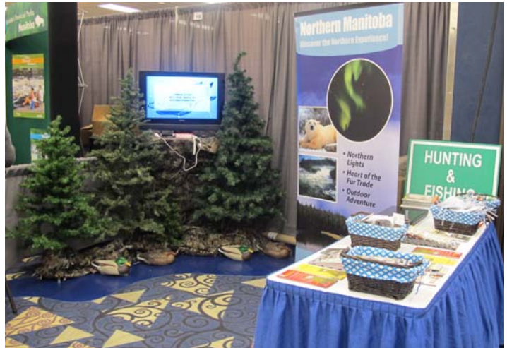
Tourism North booth at the 2012 Winnipeg RV Show Corporation and the Town of the Pas.

Tourism North partners include Community Futures Greenstone, Thompson Unlimited, Community Futures Cedar Lake, Norman Regional Development