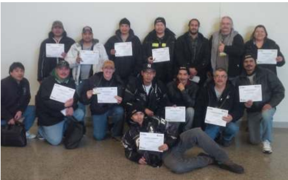
Some of the Expo participants CFNCD facilitated travel for with support from the Northern Manitoba Sector Council and the Province of MB.

MHCA and stakeholders have confirmed the event will continue with the 2nd annual Expo North taking place in Thompson in 2015.