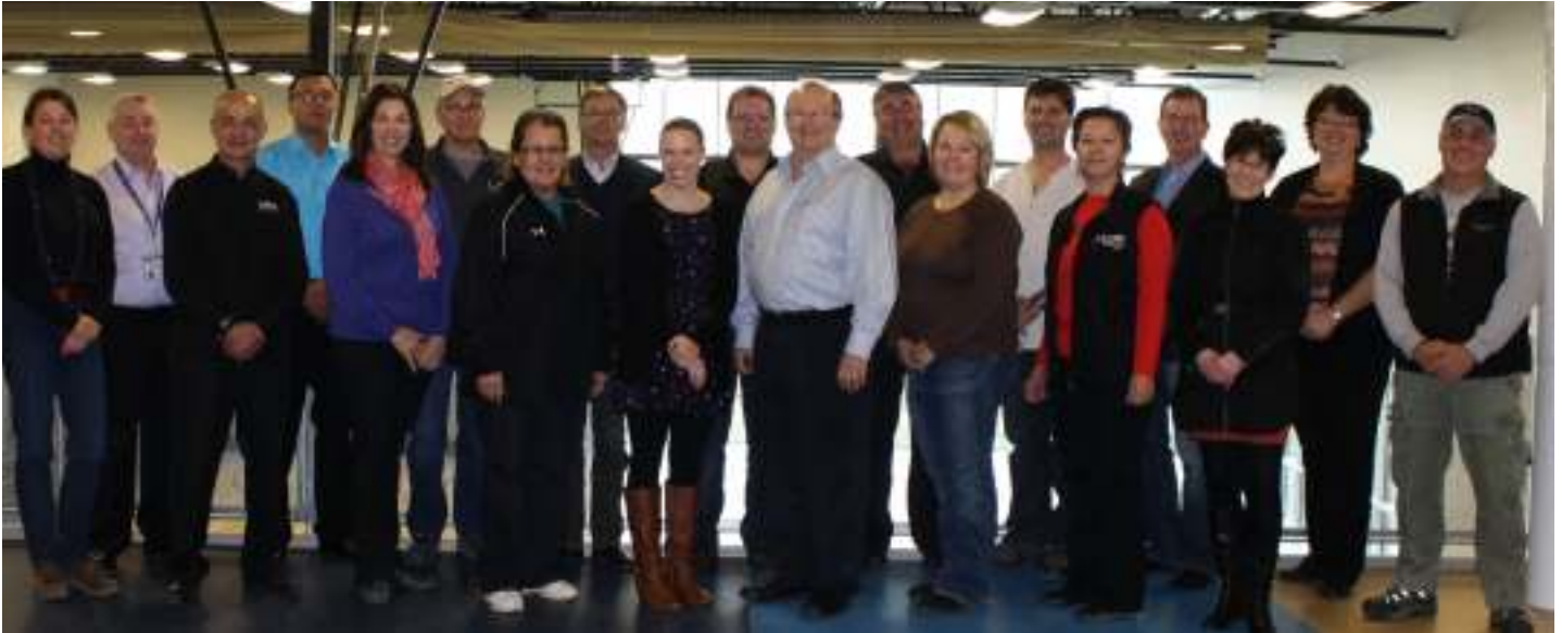
Pictured above are some of many that participated in the Expo North stakeholder committee.

Community Futures North Central Development was among 25 stakeholders which solidified the need for a heavy construction industry training event held in the north. The stakeholders were brought together initially in July 2013 by the Manitoba Heavy Construction Association, and con-