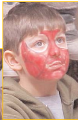
Face painting and entertainment are just a few of the activities for youth to discover at the annual Discover Manitoba Expo.