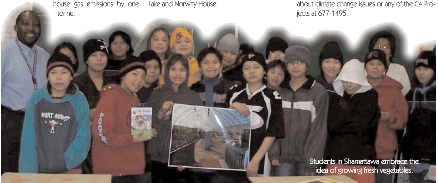
Students in Shamattawa embrace the idea of growing fresh vegetables.